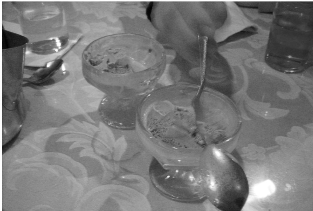
Esther Kläs, snapshot

GG: Nancy, for you there is a kind of operation of obfuscation in the translation from photographed still life to painting. In your earlier still lives as well, a digital hand performed a destabilizing action - where we could almost not read illusionistic space and something ‘out of this world’ started happening. In the paintings, you have more liberty, but it seems you stay true to this interest in a kind of other-worldly still life. We’re seeing a push-pull between depiction and invention. In Peoples and Cultures, there is almost a wool pulled over our eyes - where what seems like depiction of found artifacts are, in fact, sculpted subjects by the artist. Are these invented figures and artifacts? Are they based on things you’ve seen? Did you make them with the intention of photographing them?